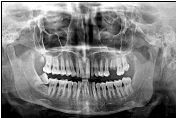
Fig 1: Orthopantomograph showing impacted molar (mesioangular) in the right mandibular jaw region

The results from two observers were analyzed for both maxillary and mandibular third molars showing insignificant inter-observer bias (Figure 2). The inclusion criterion includes healthy volunteers with no medical history because some diseases affect the presence and development of third molar teeth and patients who had not undergone surgical removal or extraction of any tooth.