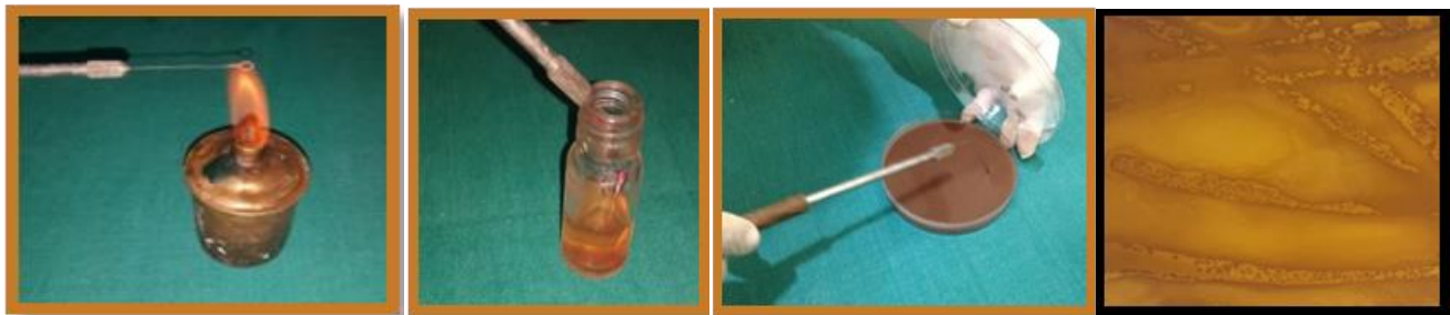
Fig 3: Infected broths inoculated in MacConkey agar and chocolate agar for 48hr for aerobic culture than Inoculated on to supplementary blood agar for 72 hr for anaerobic culture Colony forming units, if any, was counted manually.