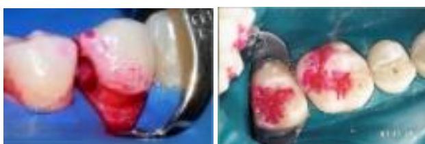
Fig 4: Representing Areas of stained areas.