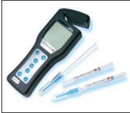
Fig 1: Caries susceptibility testing meter.

Stimulated saliva is collected and applied to both the sides of the dip-in-slide. Then it is incubated for hrs at 37 °C. The CRT buffer is available in a strip form, which changes color to indicate whether the patient has a high, medium or low buffering capacity. This occurs in five minutes.