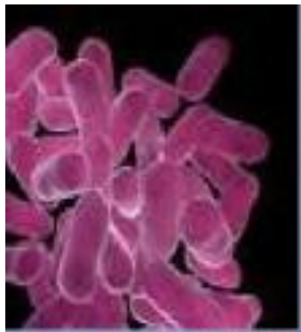
Fig 6: Lactobacillus Colony Count Test.