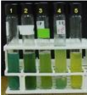
Fig 5: Showing Snyder test.