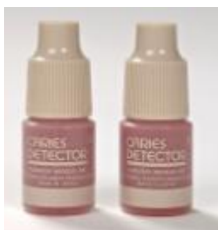
Fig 3: Caries Detector Dyes-Several dyes have been tested

-In human carious dentine two layers of decalcification can be identified: one layer of decalcified dentine which is soft and cannot be remineralized; and a second decalcified layer which is hard, with intermediate decalcification and can be remineralised.