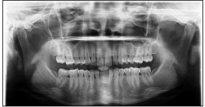
Fig 1: Pre-operative OPG

contour. Customized abutment was placed on the implant analog and twin metal ceramic crowns were made with the screw access hole on the labial side due to lingual angulation of the implant. The healing cap was removed and customized abutment was placed with 20 Ncm using a torque device and a large hex driver tip. The precise fit between the individualized abutment and the implant was verified radiographically. The occlusal contacts were carefully evaluated and implant protected occlusion was given. The screw access hole was covered with flowable composite of same shade. To date, the restoration has been in service for 18 months without complications.