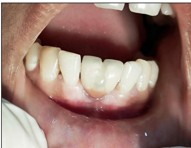
Fig 5: Access hole covered with composite