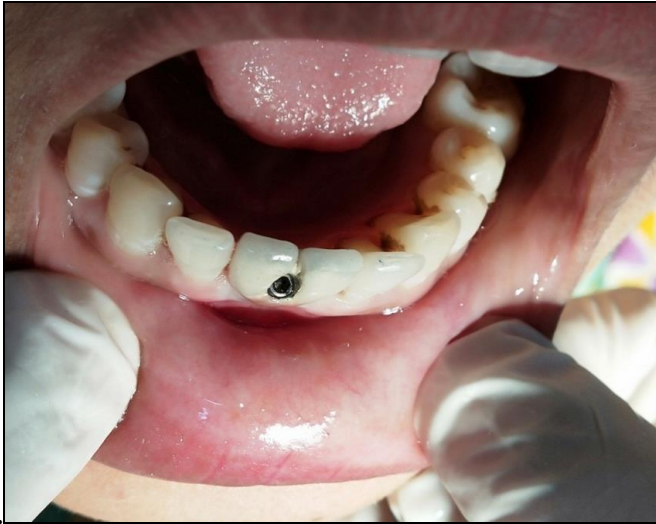
Fig 4: Prosthesis in mouth