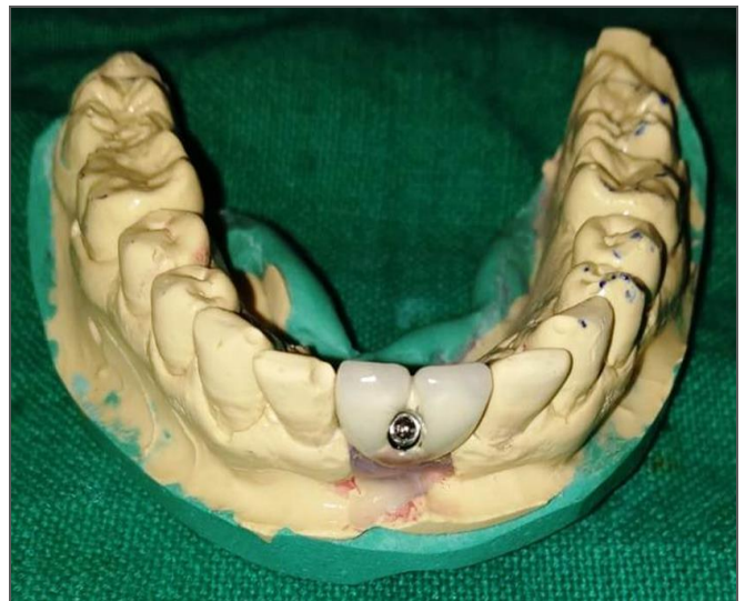
Fig 3: Prosthesis with access hole placed labially