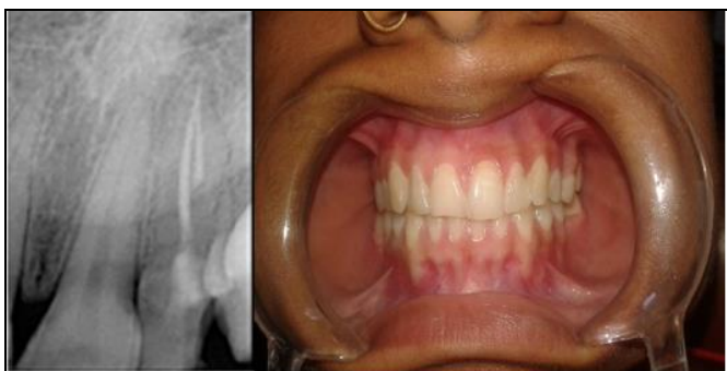
Fig 4: Postoperative after 1month (Radiograph and clinical photograph)