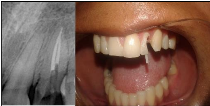
Fig 3: Post placement (radiograph and clinical photograph)