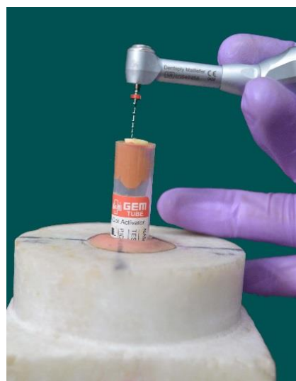
Fig 1: Simulation of periodontal ligament by silicone impression (blue arrow) material and customized jig for standardization of instrumentation (white arrow)

Similar lowercase superscript letters in the same column indicate no statistically significant differences ( P > .05 ).