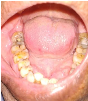
Fig 2: Intra-Oral Photograph