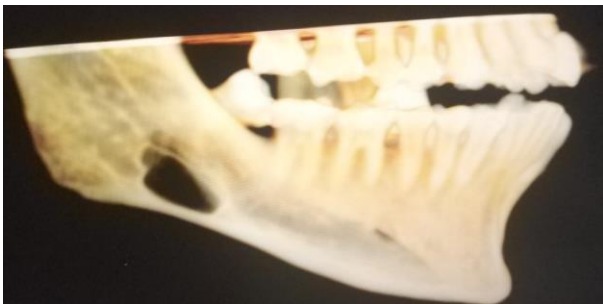
Fig 3: 3D CBCT Showing Defect In Right Posterior Mandibular Body Ramus Region.