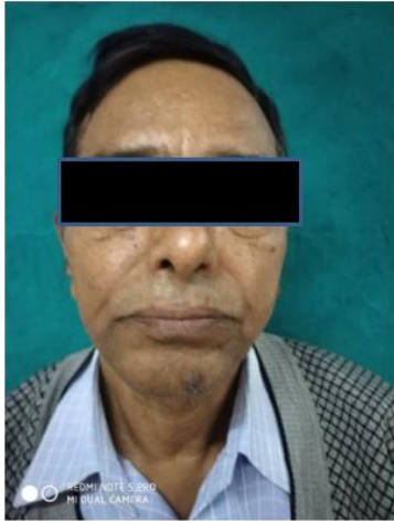
Fig 1: Extra-Oral Profile Photo of Patient