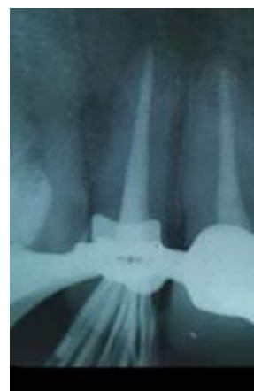
Fig 4: The obturation canal

GE1102078). Figure 4, Upon completion of root canal treatment, each canal access was sealed temporary with a glass ionomer restoration (Kavitan plus SpofaDENTAL, Czech Republic, lot: 2481885-1). A periapical radiograph was then carried out to ensure the accuracy of root canal obturation, and any improper obturation was retreated and excluded from the study.