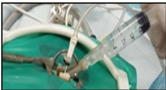
Applying cold saline clinically

In groups 3 and 4, irrigation needle inserted to the working length and another irrigation needle supplying the 20 ml saline solution during 5 minutes at the canal orifice.