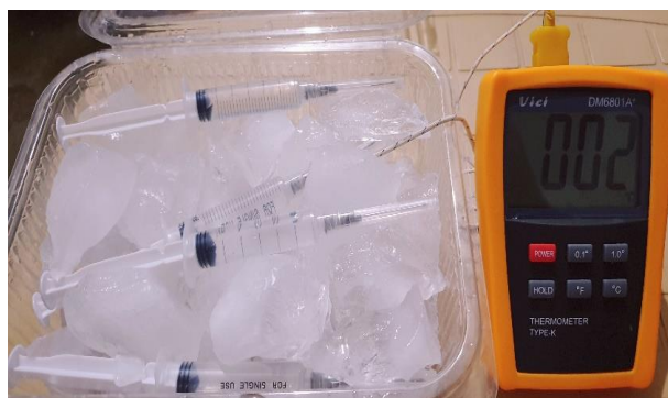
Saline 2 °C

CTH-608A Outdoor Thermometer, China) inserted inside to confirm the 2-4 °C temperature range. Figure 2