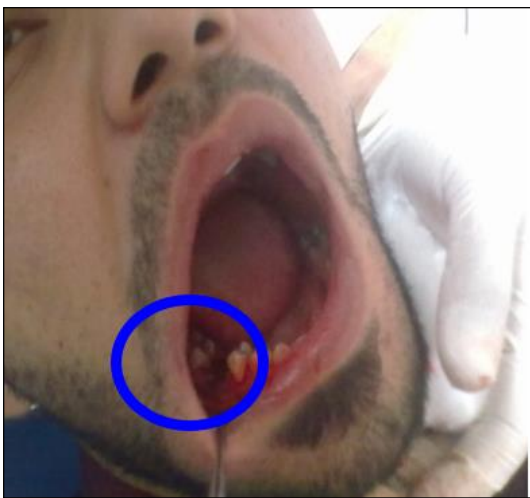
Pic 2: The tooth was extracted without any damage to the buccal (or) lingual plates of the alveolar bone