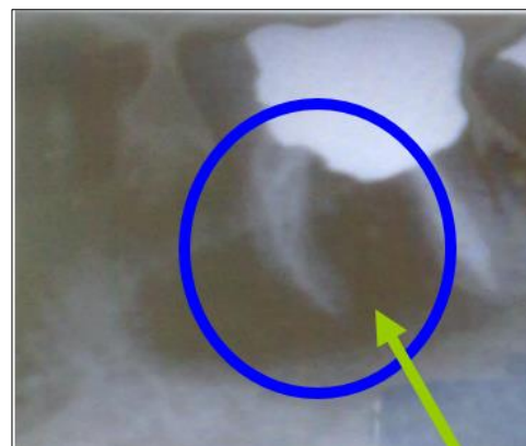
Pic 1: the radiograph showed, there was (periapical, bifurcation) radiolucency and root canal filling with unsatisfactory obturation

First case report: A 23 - years old male patient was referred to with a complaint of recurrent pain and discomfort in the mandibular right area. clinically there was sinus tract present, associated with the 1 st right molar, the crown filled with a large amalgam filling, radiology showed there was apical radiolucency, also there was radiolucency in bifurcation area and root canal filling with unsatisfactory obturation see Pic. (1). Diagnosis of chronic per apical lesion was made.