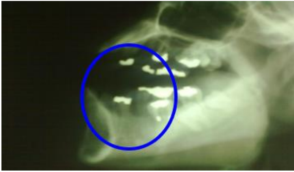
Pic 7: After 2 week, the tooth with fixation

Second Case: A 25 – years old male, with of complaint of severe pain following the retreated Root Canal Therapy (R.C.T) to the right upper second premolar. Clinically, there was a large disto occlusal (DO) cavity. Radiographic, there was a small periapical lesion. The patient refused to continue endodontic treatment because R.C.T might need multi-visit until the pain subsides and he was could not bear more pain. He was a desire to keep his tooth in another way but if there was no other way to keep it, he would extract it. So other options had been discussed with him, all complications of each option were mentioned. At the end of the discussion, the patient decided to extract the tooth and replantation. Given the patient's desire and difficulty of endodontic surgery because the root near the sinuses so the decision was to employed IR as an alternative method to keep the tooth.