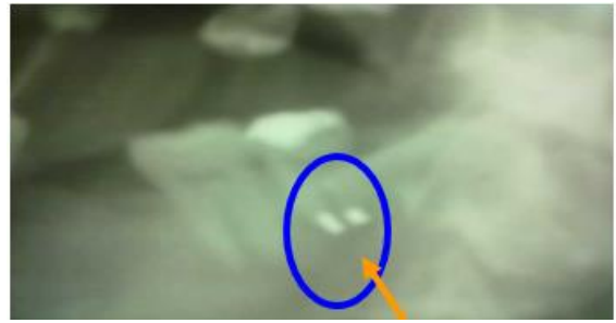
Pic 15: Tooth after one weak