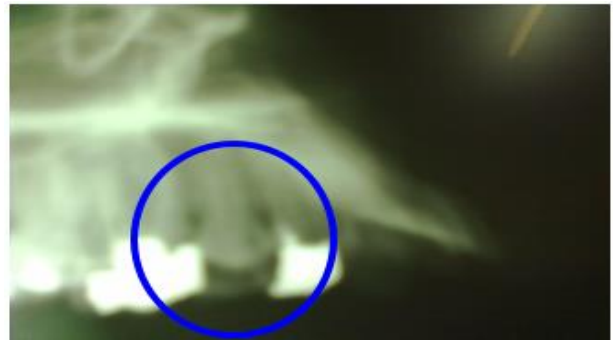
Pic 9: Radiograph shows apical lesion and root canal filling

Same previous precaution in 1 st case was done, then tooth extracted carefully, after good apical seal the tooth reinserted to its cavity and fixed the tooth to the adjacent teeth by glass ionomer cement. The procedure was carried out in a total of 20 minutes an appointment gave to the patient after one weak. Examination after one weak showed no sign or symptom of inflammation, follow up 8 months postoperatively by Radiographic, showed there was no root resorption or ankylosis, clinically there was nothing abnormal notice and the patient had no complaints. see pic (9,10,11,12)