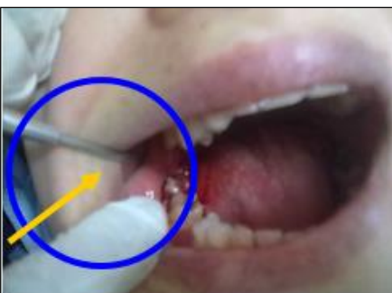
Pic 14: Tooth replantation