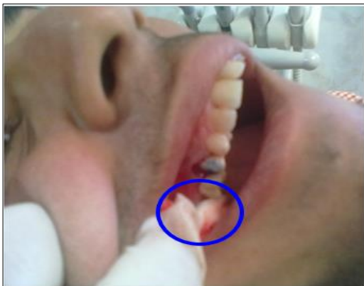
Pic 8: the tooth reinserted to its socket

Same previous precaution in 1 st case was done, then tooth extracted carefully, the RC-filling did outside the oral cavity, and DO cavity filled with LC filling. After a good apical seal, the tooth reinserted into its cavity and fixed by LC-filling. The procedure was carried out in a total of 30 minutes. An appointment gave to the patient after one weak. Examination after one weak showed no sign or symptom of inflammation, the patient had no pain and very satisfy. Follow up after 7 months, Radiographically, showed there was no root resorption or ankylosis. See pic. (8)