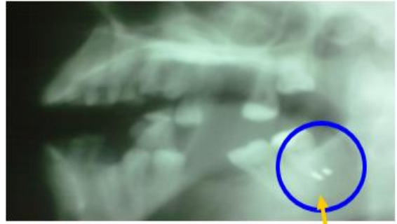
Pic 16: Tooth after 4 months no sign of ankylosis or resorption