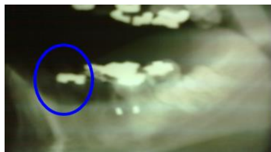
Pic 6: The tooth after 3 months no sign of resorption or ankylosis

The procedure was carried out in a total of 15 minutes. The patient was given postoperative instructions for a soft diet, careful routine oral hygiene, and gave antibiotic with an analgesic. The tooth was inspected 7, 14 days, and 3 weak postoperatively via routine intraoral examinations. At 6 months postoperative sessions there were no clinical signs or symptoms of inflammation (or) infection, no tenderness to percussion or palpitation, no pain or discomfort, sinus tract disappears, the tooth retains to natural. The patient was informed to recall visits to further follow up, also informed to come in any time complication appears. See pic. (6,7)