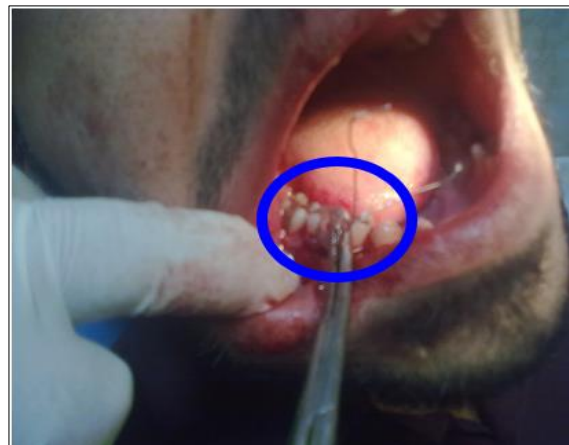
Pic 5: fixation by S.S

The procedure was carried out in a total of 15 minutes. The patient was given postoperative instructions for a soft diet, careful routine oral hygiene, and gave antibiotic with an analgesic. The tooth was inspected 7, 14 days, and 3 weak postoperatively via routine intraoral examinations. At 6 months postoperative sessions there were no clinical signs or symptoms of inflammation (or) infection, no tenderness to percussion or palpitation, no pain or discomfort, sinus tract disappears, the tooth retains to natural. The patient was informed to recall visits to further follow up, also informed to come in any time complication appears. See pic. (6,7)