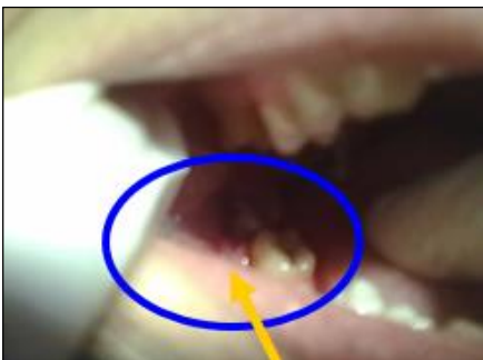
Pic 13: Tooth extraction

Same previous precaution in 1 st case was done, then the tooth extracted carefully. In this case, the tooth not filled extra orally with R.C, filling. Just I did a good apical seal to the root with amalgam then the tooth reinserted to its cavity (I follow steps reported by Chandra RV, Bhat KM to manage this case) (see ref, 7) and finally fixed by glass ionomer cement with the adjacent tooth. The procedure was carried out in a total of 25 minutes. Examination after one weak showed no sign or symptom of inflammation. After 2 weeks the soft tissues appeared pink in color with minimal inflammation and pain upon biting had diminished. After 7 months radiographic showed there was no root resorption or ankylosis, the patient had no complaint and the tooth retain natural function.