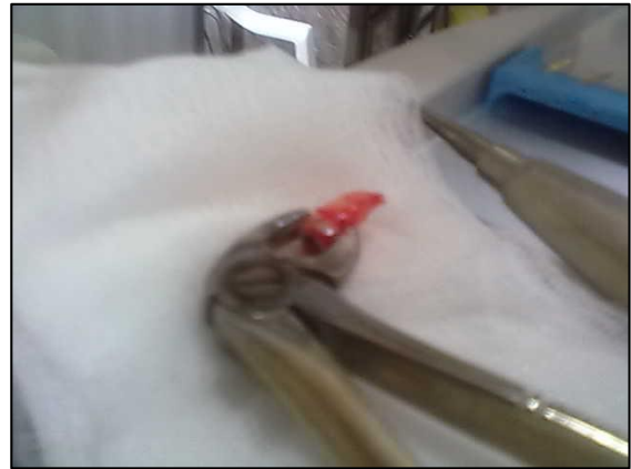
Pic 4: tooth had been kept in a wet sterilized gauze

during that the tooth had been kept in wet sterilized gauze, this increases the possibility of PDL vitality. See pic (4)