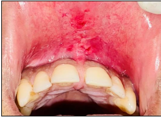
Fig 5: One week follow up after suture removal