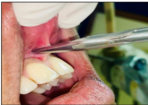
Fig 1: Frenum held with Haemostat