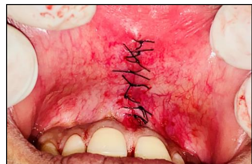
Fig 4: Placement of 4-0 suture