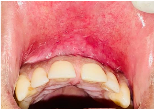
Fig 6: Three months follow up