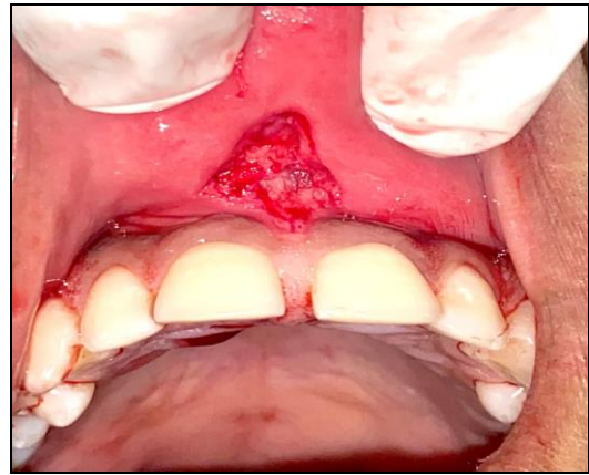
Fig 3: Excision of frenum with scalpel