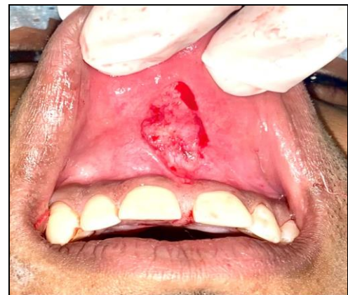
Fig 4: Separation of attached fibers