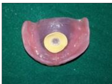
Fig 1: Show the Suction discs for denture retention.