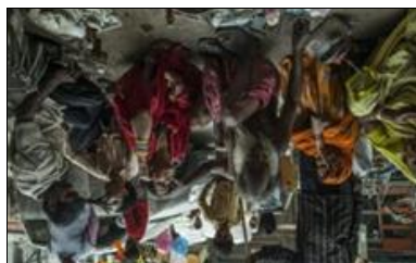
Fig 7: Restoration using self-curing acrylic as restorative material.