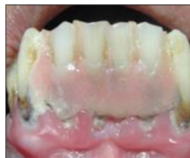
Fig 5: Fixing a tooth in edentulous area with the help of ring plating on the adjacent tooth.