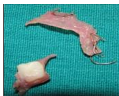
Fig 6: Use of hydrogen peroxide for stain removal and whitening of the teeth.