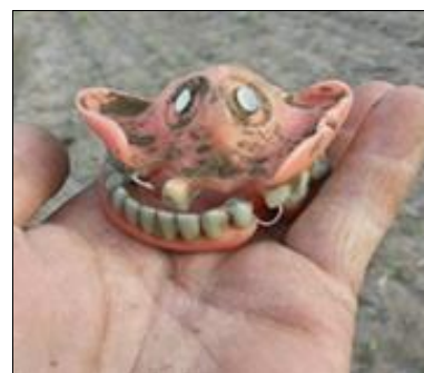
Fig 4: Performing dental procedures without sterilizing instruments.