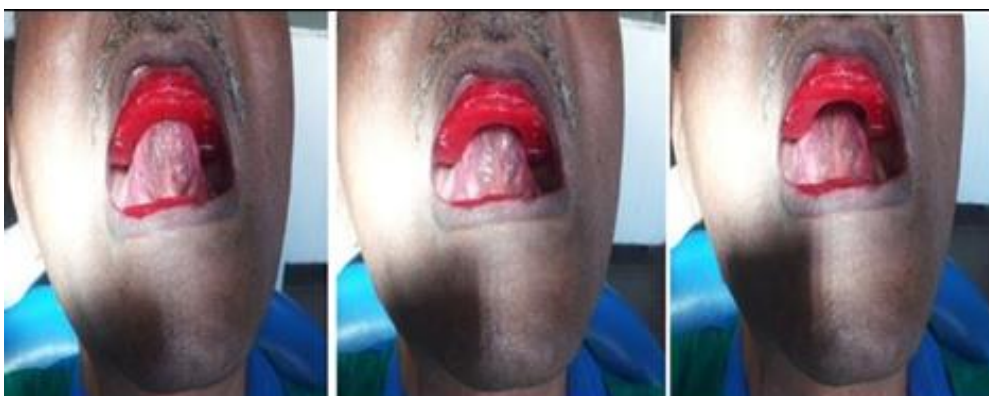
Fig 2: Centric record using the wax ball technique