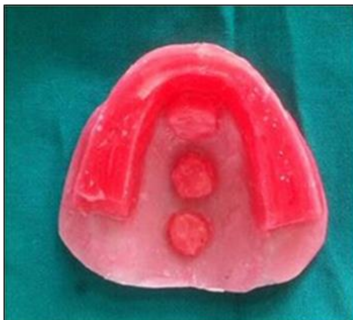
Fig 1: Placement of wax balls on the maxillary denture base

After the establishment of orientation and vertical jaw relation, three wax orientation balls, 1 cm in diameter and 2 mm in thickness, were sealed to the upper record base of the first set of rims along the midline; one behind the incisive papilla, the second at the center of the palate, and the third immediately anterior to the posterior palatal seal region. (Figure 1). The record bases were then inserted into the mouth; the participants were instructed to relax, to open the mouth up to 20–25mm, and to put the tip of the tongue into the first (anterior most) orientation ball, then move it into the second, and finally to the third orientation ball. Holding the tongue on the third orientation ball, were instructed to close their mandible which would activate the elevator muscles to push the condyles into the fossa. (Figure 2) When the patient repeated this tentative centric relation position, the rims were sealed using the nick and notch method and records were mounted on the articulator.