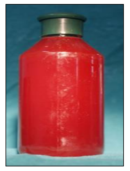
Fig 3: Prepared mangosteen mouthwash