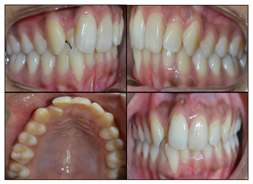
Fig 1: Pre-treatment intra-oral photographs