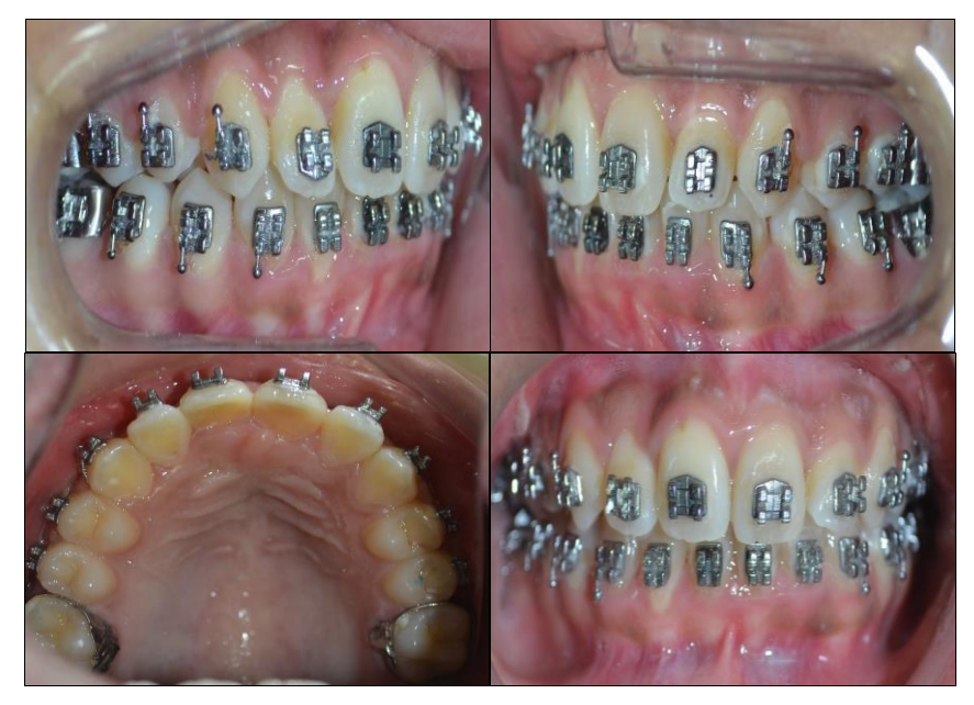
Fig 6a: Intra-oral photographs following alignment and levelling