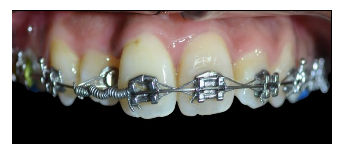
Fig 4: Rotation correction after 2 months of treatment

In this case, the lateral incisor was rotated mesially. The spring was compressed such that it provided a distally directed light constant force as it tried to open up. Rotation correction was obtained after 2 months and the tooth was ready to be ligated to the main archwire. (Fig 4)