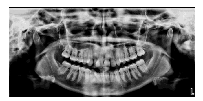
Fig 2: Pre-treatment OPG

The treatment objectives were to relieve crowding in the upper and lower anterior segment, correct the inclination of the upper incisors and to create space and derotate 12. Bonding of the teeth in the upper and lower arch was done using 0.018-in slot MBT brackets (Orthox; US Orthodontics). After placing the initial archwires for alignment, space creation and derotation of 12 was done using the ANG (Anghileri) technique. 0.016-in stainless steel wire was placed in the main bracket slot. A bondable button was bonded on the buccal surface of the rotated and palatally blocked-out lateral incisor 12. An open coil spring was placed between the brackets of 11 and 13 which was compressed to one-third its original length using a ligature wire, the other end of which was tied to a button bonded on the buccal surface of 12. (Fig 3).