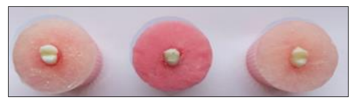
Fig 1: Group A, B and C samples respectively.

Group C: MOD cavity restored with horizontal glass fiber post and resin composite restoration (Fig 1)