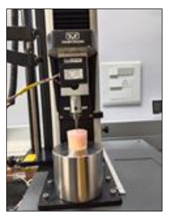
Fig 3: Testing of sample under Universal Testing Machine

The samples of each group were tested with a Universal testing machine using a metal indenter. (Fig - 3) This was mounted on the upper arm jig and the sample block containing the tooth mounted on the lower arm jig. A cross head speed of 0.5 mm/min was set and the load applied on the palatal cusp 2 mm from the tip of the cusp towards the central fossa. The maximum load at which fracture occurred was recorded. The results were tabulated after recording the maximum load at fracture for each sample. The fracture strength and type of fractures which were observed were analysed.