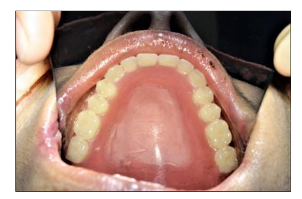
Fig 13: Maxillary fixed salivary reservoir