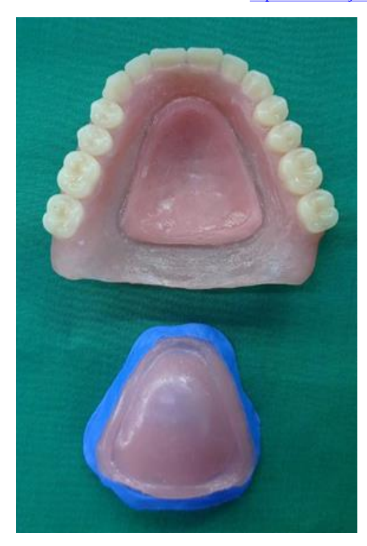
Fig 6: 1 mm of wax added on palate with carved margins and hard pink wax used to make lid with snap on attachment