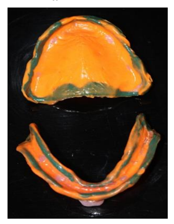
Fig 2: Final impressions