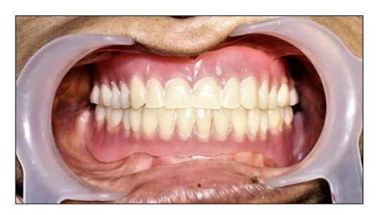
Fig 12: Final complete denture in occlusion