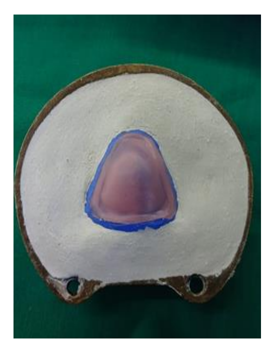
Fig 7: Flasking done