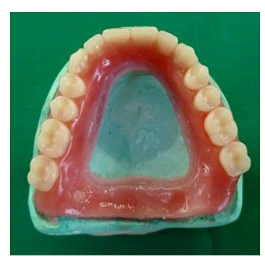
Fig 5: Palatal portion of denture base & wax removed