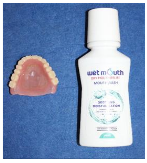
Fig 10: CMC salivary substitute liquid