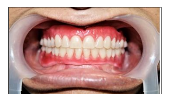
Fig 4: Waxed up denture trial