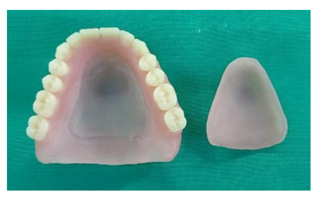
Fig 8: Processed maxillary denture and lid