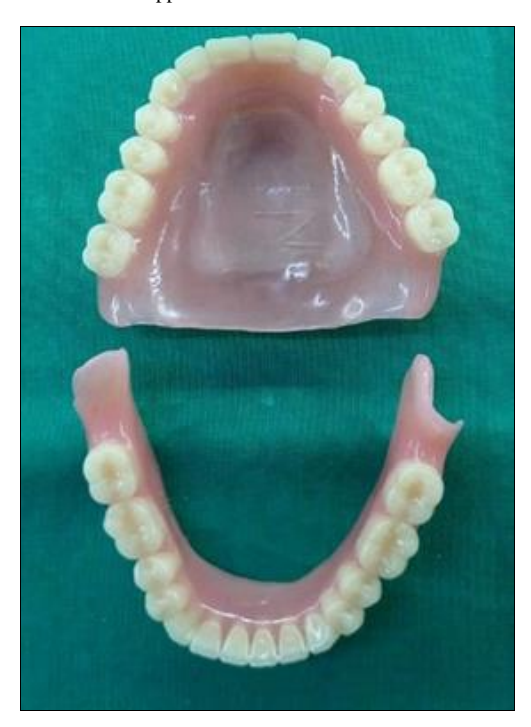
Fig 9: Final finished polished denture