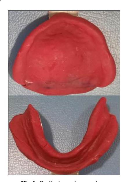
Fig 1: Preliminary impressions